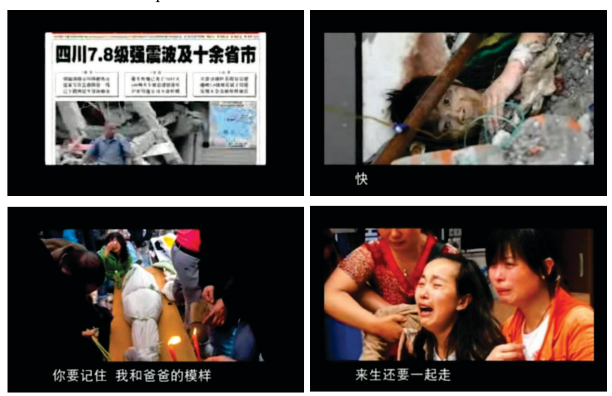
Figure 4: Still images from YouTube video poem version of "Haizi, kuai zhua jin mama de shou" 《孩子快抓紧妈妈的手》 ("Child, Quickly Grab Hold of Mama's Hand") posted May 19, 2008 by bibiex, https://www.youtube.com/watch?v=GeibnWyQfc8

uploaded to the Internet and broadcast on television."64 These videos often included background music, and they were frequently accompanied by subtitles carrying the poetic text and image collages of often graphic news media images of victims of the earthquake.<sup>65</sup>