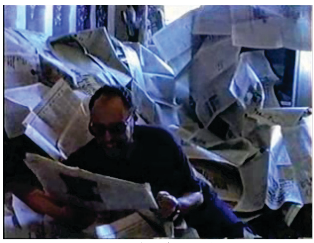
Figure 1: Still image from Prigov (1989)

Like Medvedev's poem, Prigov uses direct quotation to give voice to extremism (in this case Soviet anti-separatist nationalism).<sup>31</sup> But unlike Medvedev, Prigov embodies the text without ever even offering an alternative viewpoint, just as he gives voice to the official party line rather than the confusion of Internet babble. One might impute a lyric hero to Medvedev or Lvovsky's poems: the subject who struggles to negotiate between the words of others and one's own words. Prigov's work would seem to offer no such possibility.