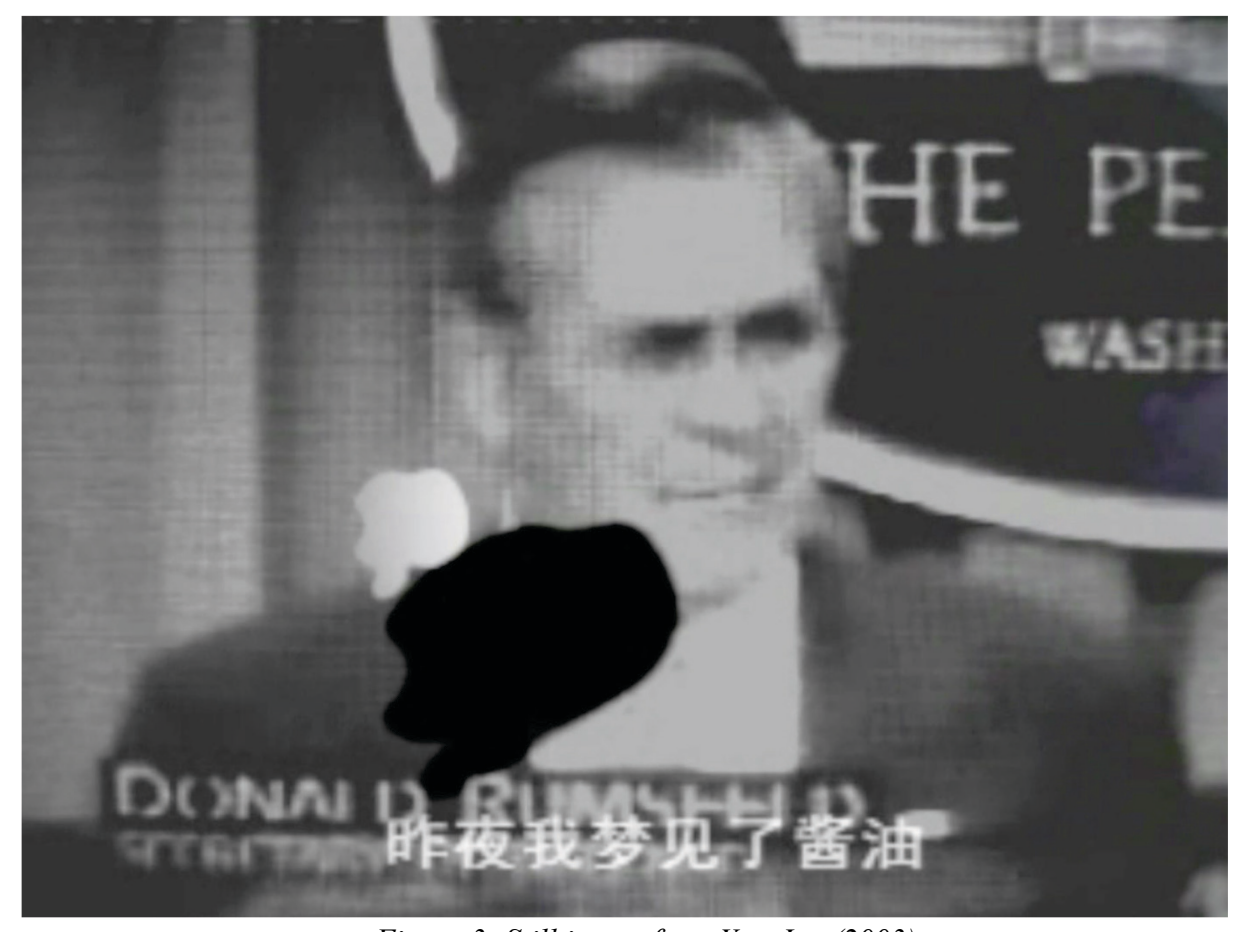
Figure 3: Still image from Yan Jun (2003)

recording.<sup>55</sup> Yan Jun's poem is dated December 2000. However, the Beijing performance took place in the aftermath of the 2003 US invasion of Iraq and just as the seriousness of the SARS outbreak was becoming clear. In the performance, Yan Jun, well known as a DJ, read the poem accompanied by music and by a video montage. As with Liao Yiwu, it is the video montage that makes the work a documentary montage piece, since the text itself is not made of citations. By overlaying some of the lines of the poem with images, however, Yan Jun entangles his own words with the news, so staging an encounter between poetry and mass media that is simultaneously an encounter between the poetic text and contemporary music and video and performance art.