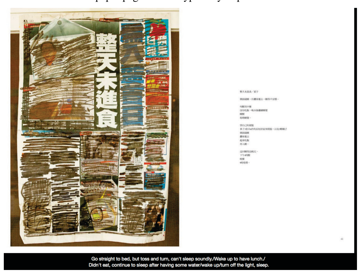
Figure 5: From Hsia Yü et al. (2012).

highlighted the tension between lyric poem and journalism and between verbal and visual media by presenting the works both as photographic reproductions of the crossed-out newspaper pages and as typeset lyric poems.